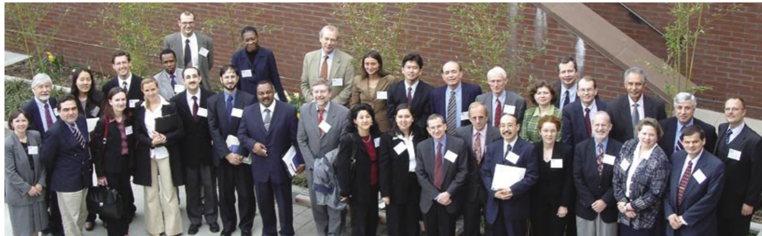
Representatives of the United Nations Security Council convene annually at the Watson Institute for sanctions training exercises.

perspective. Most recently, the Institute was granted Special Consultative Status with the United Nations' Economic and Social Council, one of a relatively few NGOs worldwide to receive this distinction. The Institute also works closely with the UN Security Council on annual sanctions training exercises, the UN Development Programme's Human Development Report Office, and the UN Environmental Programme on north-south